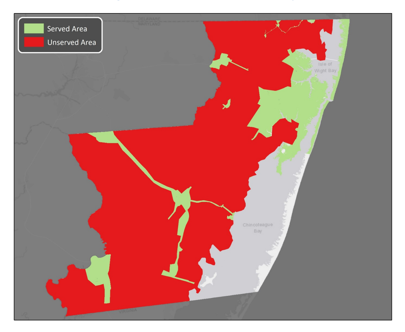
Figure 1: Unserved Portions of Worcester County

The County's analysis indicates that about 6,400 homes and businesses in the County do not have access to internet service that meets the federal definition of broadband. Surveys of wireline infrastructure determined that the County's unserved areas are the red highlighted portions of the map below (Figure 1). The southern portion of Assateague Island was not included in the analysis; that land is shaded white in the map.