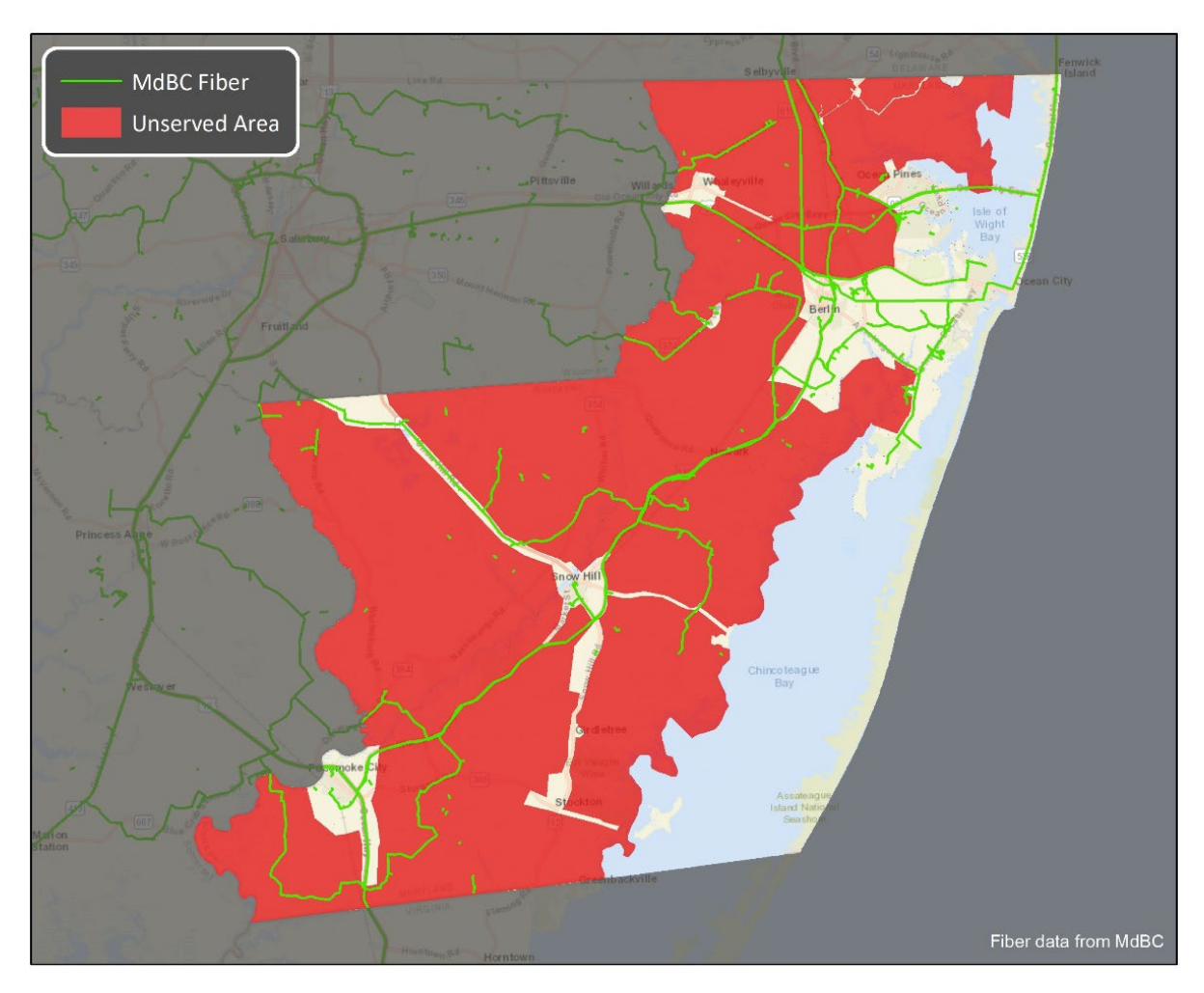
Figure 3: MdBC Fiber Routes